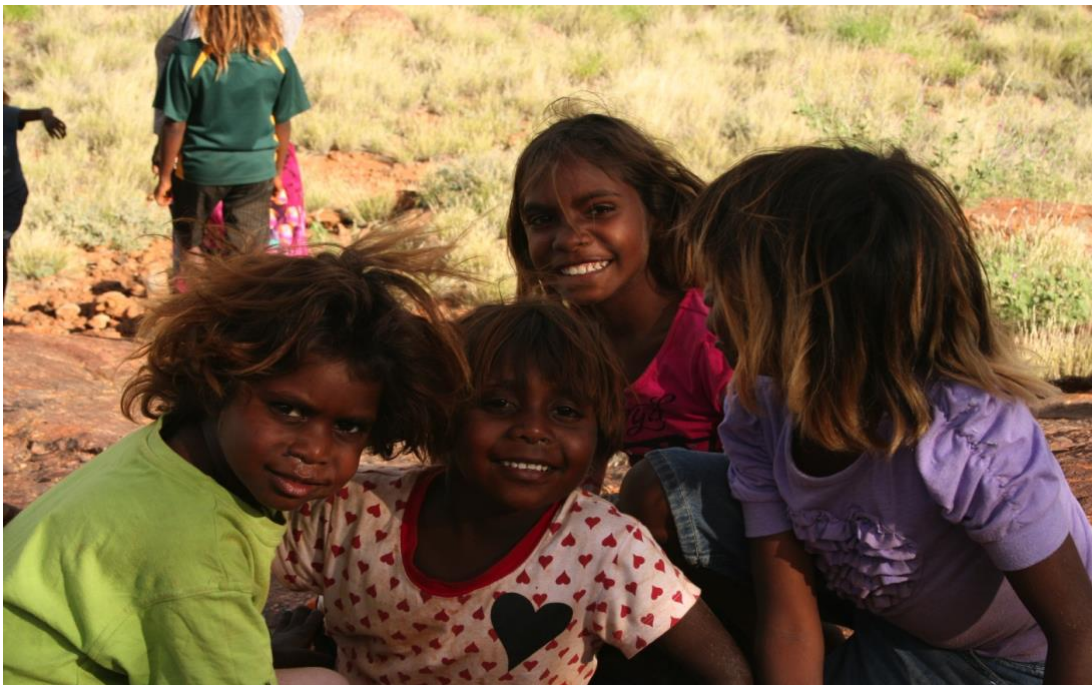
Making a Will helps to look after the next generation