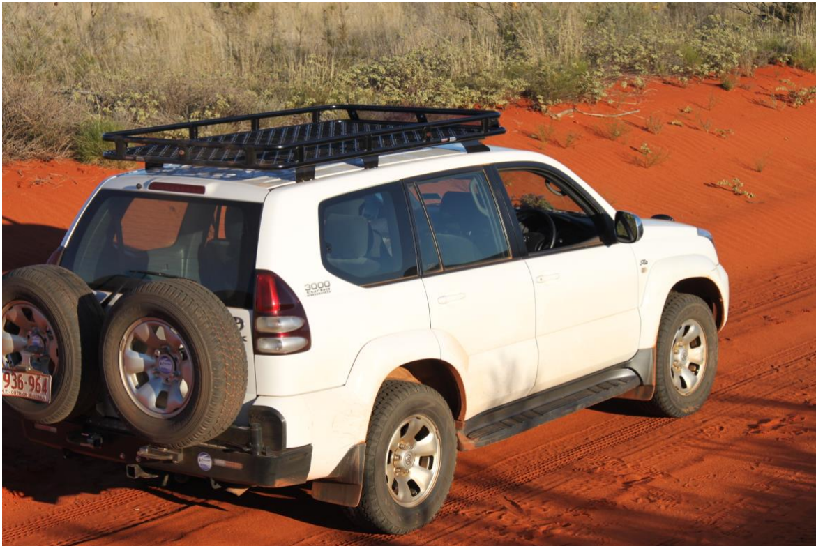
The estate will include any car owned by the artist

If the deceased owned a car, it will need to be transferred into the name of the correct beneficiary or, if the car is to be sold so that money can be divided among several beneficiaries, the name of the purchaser.